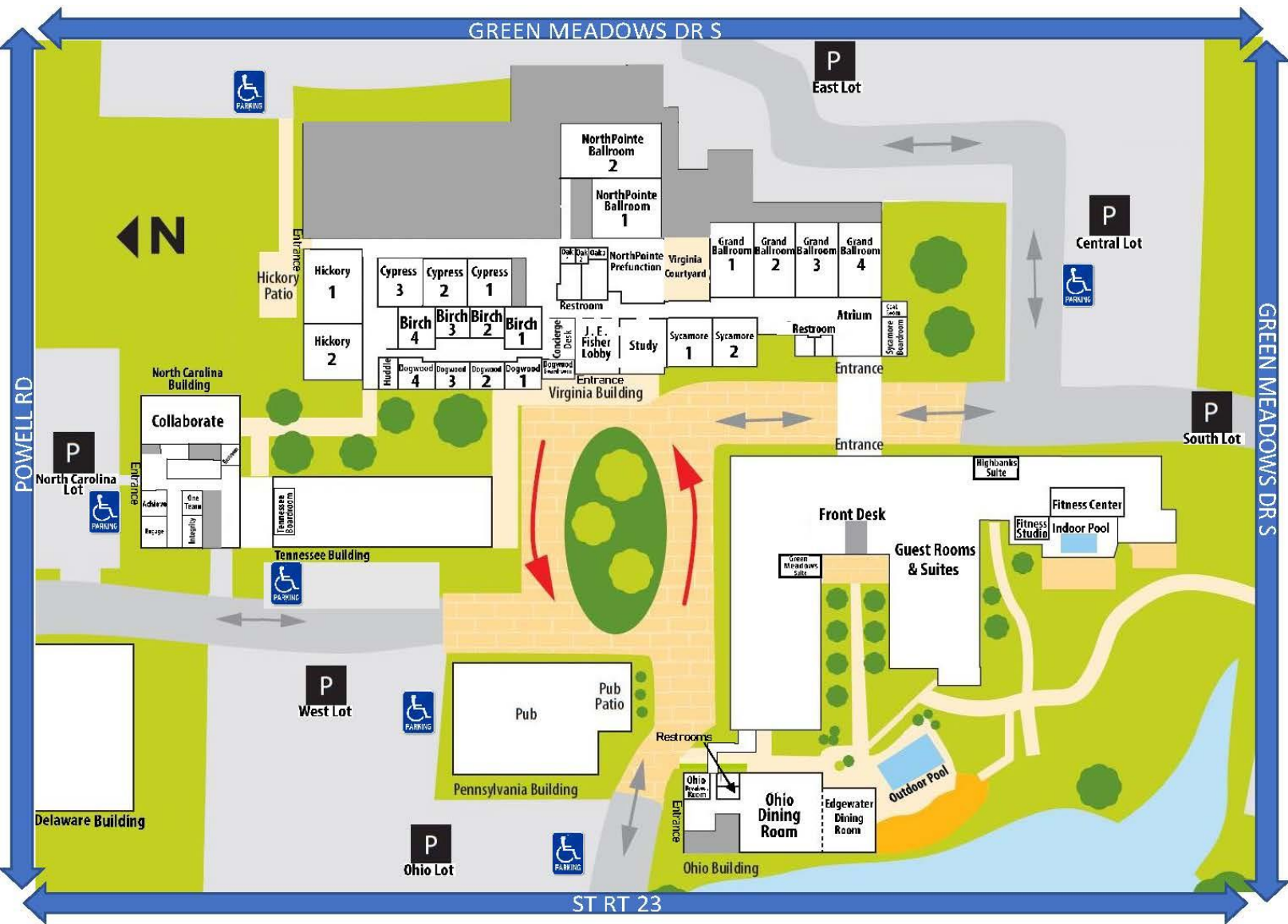
Property Map and Convention Floor Plan Nationwide Hotel and Conference Center